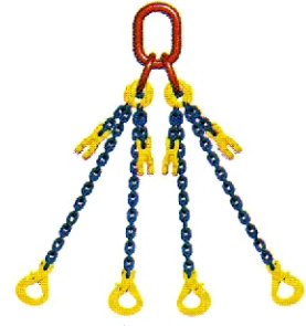
Four Leg (With Shortening Clutch)