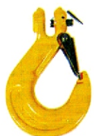
Clevis Hook With Latch