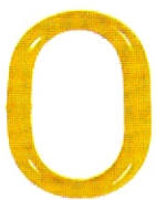
Masterlink For 1 & 2 Leg