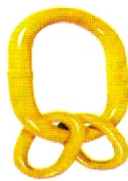
Masterlink For Assly For 3/4 Leg