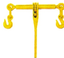
Ratchet Load Binder