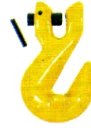
Clevis Grab Hook