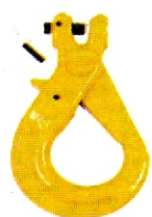
Clevis Self- Locking Hook