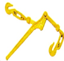
Lever Load Binder